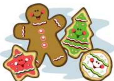
Cookies with Santa

Donations for cookies are welcomed and appreciated! Please reach out to the church office if interested in donating cookies!